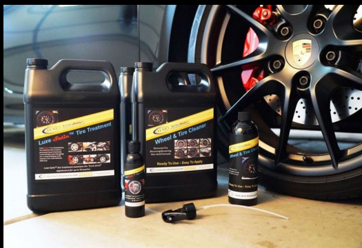
Luxe Satin ™ Tire Treatment