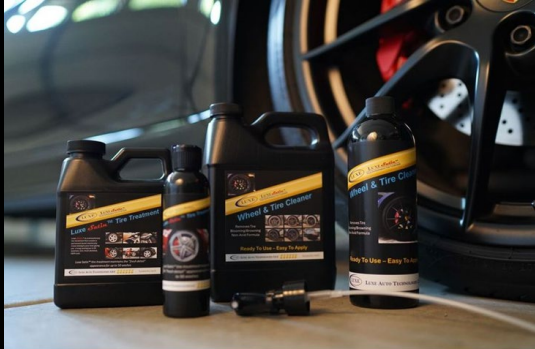
Luxe Satin ™ Tire Treatment

LUXE Satin ™ High Performance Tire Treatment