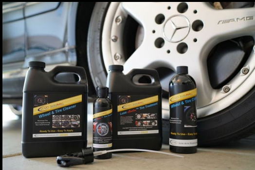
Luxe Satin ™ Tire Treatment